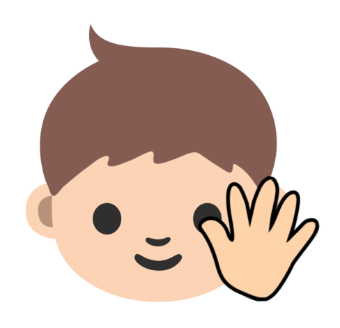
Don't Touch Face

Washing our hands frequently with soap and water can help eliminate the germs we spread to the people and things around us.