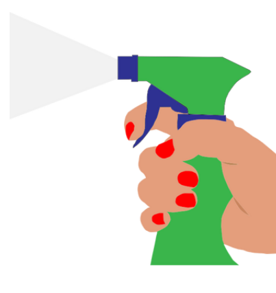
Clean & Disinfect

Covering our mouths and noses when we cough or sneeze can stop germs from landing on surfaces or other people around us, reducing the spread of illness.