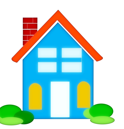
Stay at Home

Staying in our homes and avoiding contact with other people is the best way to slow the spread of this illness.